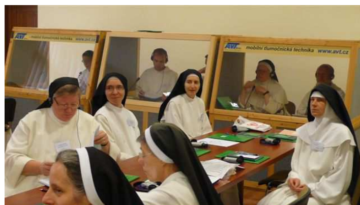
On the picture: Nuns from Norway, Germany (one of them is a Hungarian), Poland and the Czech Republic at the Euromon in Poland, 2012

We celebrate the liturgy each day in one of the three official languages; some parts are sung in Latin (the Benedictus, Magnificat and the Ordinary of the Mass). Booklets with the liturgical texts are distributed to everybody so that all can participate. The Mass readings are printed out in all three languages. The homily is translated into one other language.