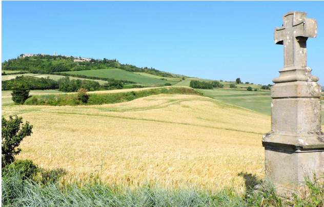
The cross of the sicarius with Fanjeaux in the background.

The Year of the Consecrated Life and the 8 th Centenary of the founding of the Order of Preachers call on us to undertake this pilgrimage, since we are gathered here in the places where it all began. Pope Francis urges us to reflect on the past with gratitude in order to take from it the spark that inspired our Founder.