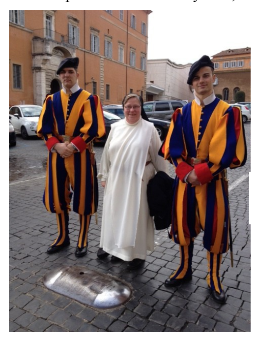
Switzerland in the Vatican

The Holy Father has received all the information and is preparing the document on the "Contemplative Life". Only then, and on the