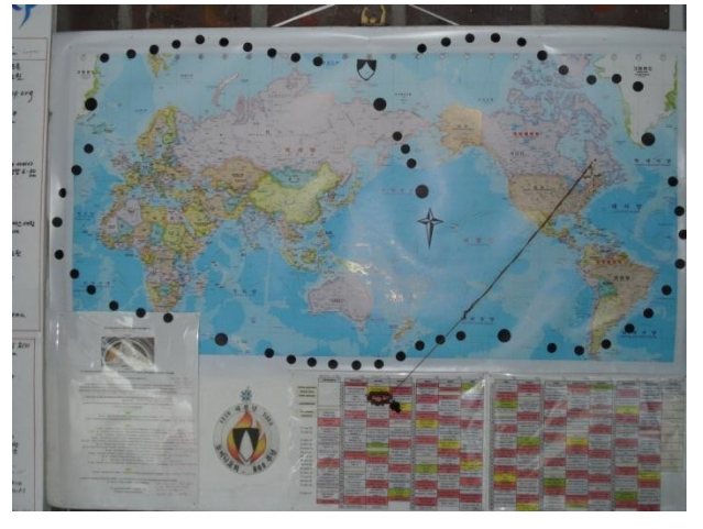
photo we have put a calendar near a large map of the world, with every two days marking off the Monastery which is in charge of the Rosary for those two days. This plan is a sister's initiative; it really gives us joy and helps us to be united to all of you, our sisters. One day at the end of last November an e-mail arrived from the Monastery in Jaen-SPAIN telling us that our rosary had arrived and also that they were sending us photos of their community. We answered and we also sent photos—ones in which we had gotten the greatest number of pictures of the sisters.

Here we also share with you how we are living the "Missionary Rosary." As you can see in the